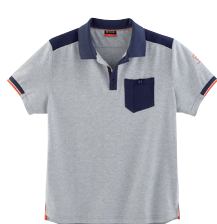
1413 HEATHER GREY