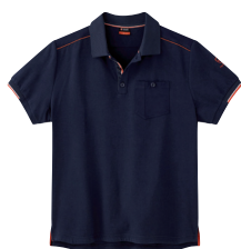
1492 PARADE BLUE