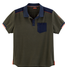
1478 HEATHER KHAKI