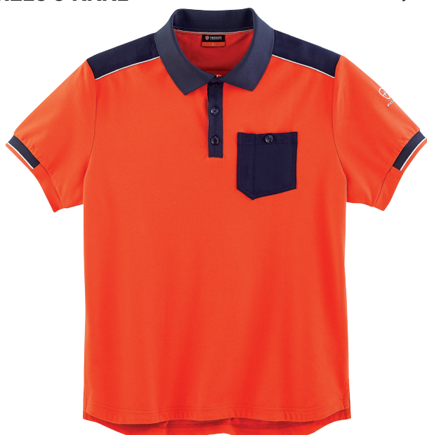
1456 PARADE ORANGE