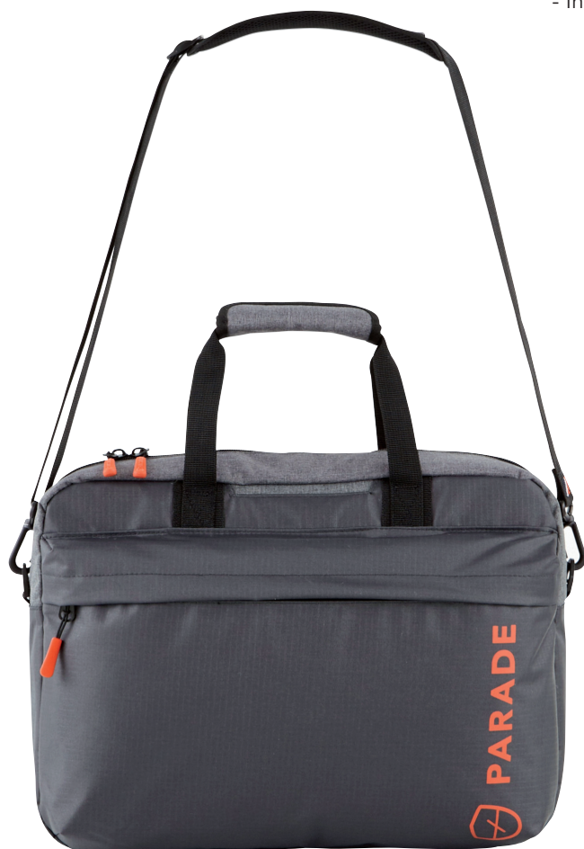
■ 1453 PARADE GREY